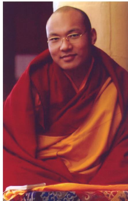
His Holiness the 17th Karmapa

His teaching opened the hearts of those in attendance and many KSC students remarked upon the intimacy and candor with which he spoke about his own spiritual journey. In a direct and powerful voice, he gave essential advice to bring one's practice into daily life. He reminded us that we are a part of a global village and therefore we must be concerned for the well-being of all, including the planet itself.